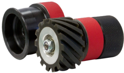
Contact Wheel (spindle)