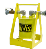
Portable Moisture Separator (Page 17-3)