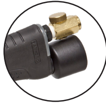
MP-6132A-6DE w/ Dust Extraction Unit