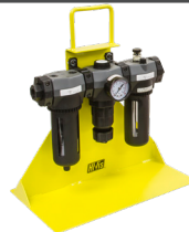
Portable FRL's (Page 17-4)