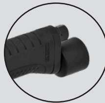
MP-6238-8DE w/ Dust Extraction Unit