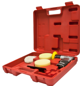
MP-6004K-ST Polisher Kit

Comes with a 3-1/2" polishing bonnet, 3-1/2" yellow buffing pad and a 3-1/2" white buffing pad.