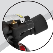
MP-6133-6DE w/ Dust Extraction Unit