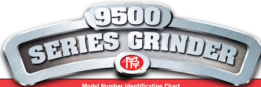
Model Number Identification Chart