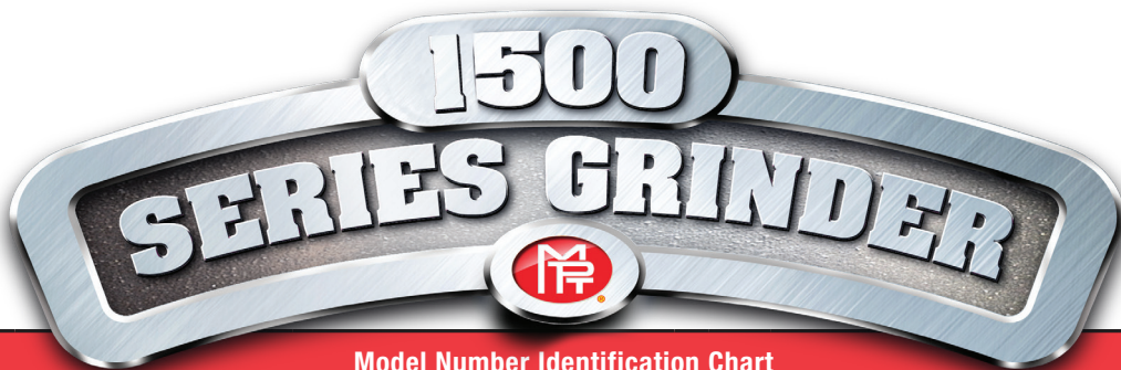
Model Number Identification Chart