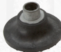
R202-38-24FEM 2" Spiral Face Pad