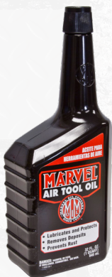
OIL-085 32oz Oil