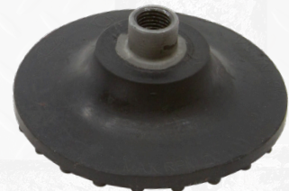
R303-38-24FEM 3" Spiral Face Pad