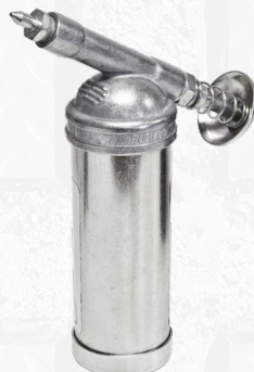
C098689 Grease Gun