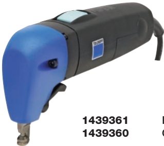
1439361 Punch 1439360 Carrier with Integrated Die