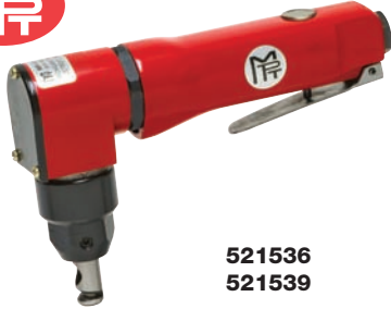
521536 Cutter 521539 Cutter Die