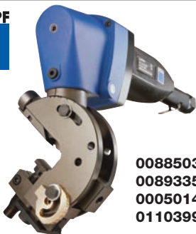
0088503 Cutter 0089335 Cutter (HSS) 0005014 Cutter (Aluminum) 0110399 Cutter (Heavy Duty)