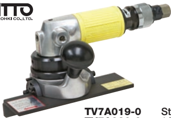
TV7A019-0 Straight Tip (2 pc) TV7A020-0 1/16" radius (2 pc) TV7A021-0 1/8" radius (2 pc) TV7A022-0 5/32" radius (2 pc)