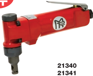
21340 Punch 21341 Die