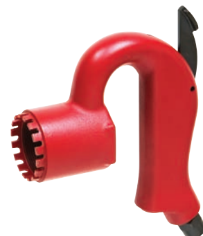
Pistol Grip (Gooseneck)