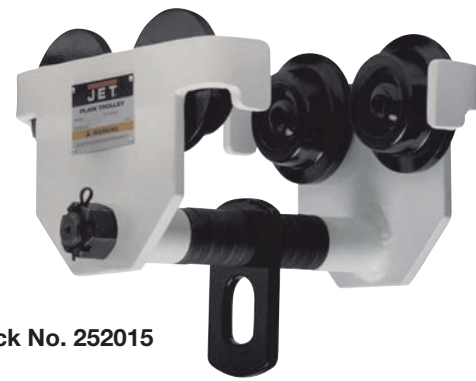
Stock No. 252015