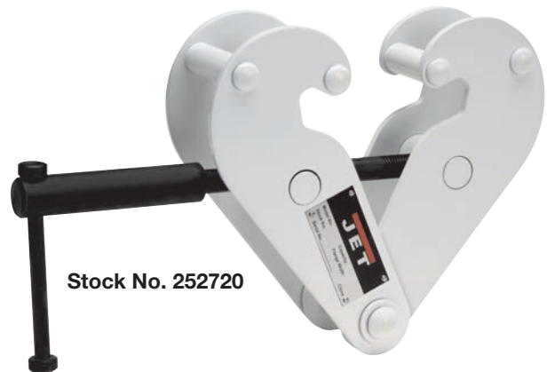
Stock No. 252720