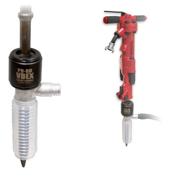
NOTE: For job sites requiring water dust suppression use the VDEX WATER PLUG.