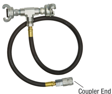
VDEX-WHIP 3-Way Whip Hose

The VDEX® system was designed for OSHA Table 1 compliance, when used according to manufacturer instructions. The JAC-3P utilizes a water-based filtration system making it compact, affordable and user-friendly.