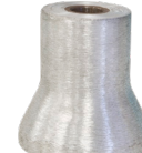
275A-802 2-1/2" Aluminum 802 Taper