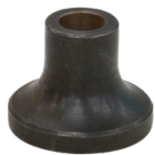
200-802 2" Steel 802 Taper