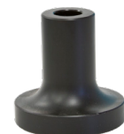
202-802SP-NY 2-1/2" Dia. Nylon