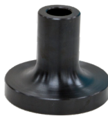
300-802 3" Steel 802 Taper