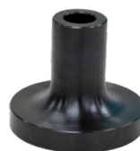
300-802-SP 3" Steel 802 Taper Screw-Type