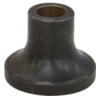
200-802-BS 2" Steel 802 Taper Screw-Type