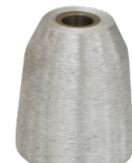
2009-SA802 2-1/2" Aluminum 802 Taper