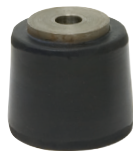
202 2-3/8" Dia.