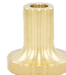
202-802SP-BR 2-1/2" Dia. Brass