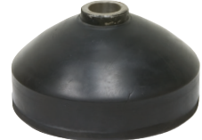
205-T 5" Dia.