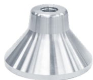
P089008 5" Aluminum Fits: CP3T