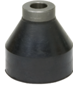
F54000D700 3-1/2" Dia.