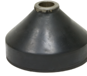
204-T 4" Dia.