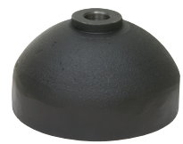
73206 5-3/4" Dia. Screw-Type