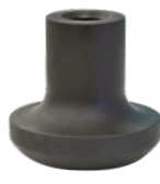
34SR-ST183-DOMED 3-3/8" Dia. Screw-Type