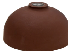
P089050 6-1/4" Aluminum Fits: CP4RV