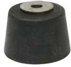
203-T 3-1/4" Dia.