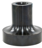
34SR-ST183 3-3/8" Dia. Screw-Type