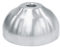
73206-AL 5-3/4" Dia. Screw-Type