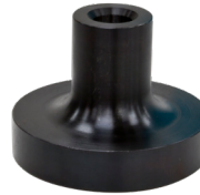
34SR-4.375 4-3/8" Dia. Screw-Type