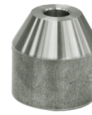
34ST-383 3" Dia. Screw-Type