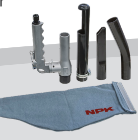
*JAC-3 Vacuum comes with Bag, Exhaust & 2 Different Nozzles