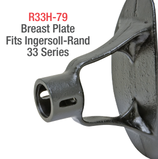
T12-347 Chuck Nut Fits Ingersoll-Rand 33 Series w/ 2MT or 3MT Spindle