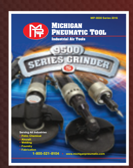
9500 Series Grinders