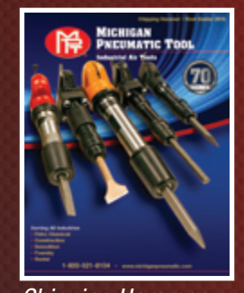
Chipping Hammer & Rivet Busters