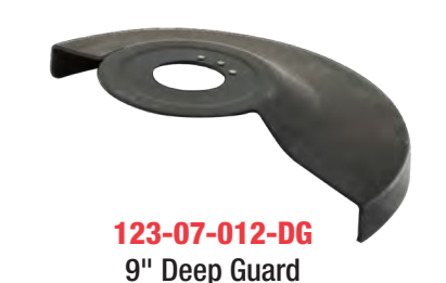
12" Model Available