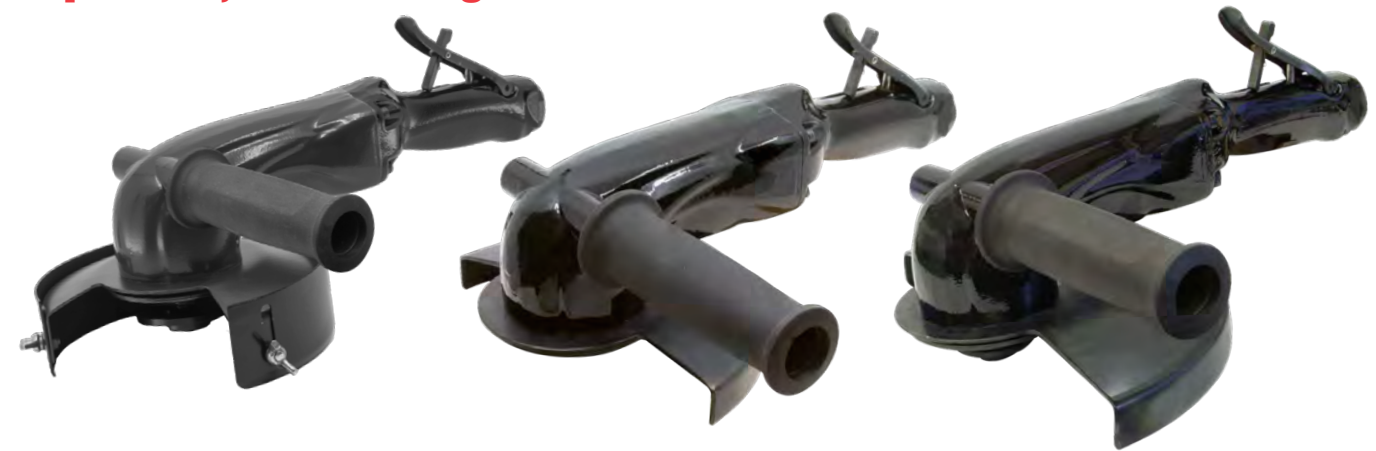
TG-6060-586-T11 6" Cup Guard Angle Turbine Grinder